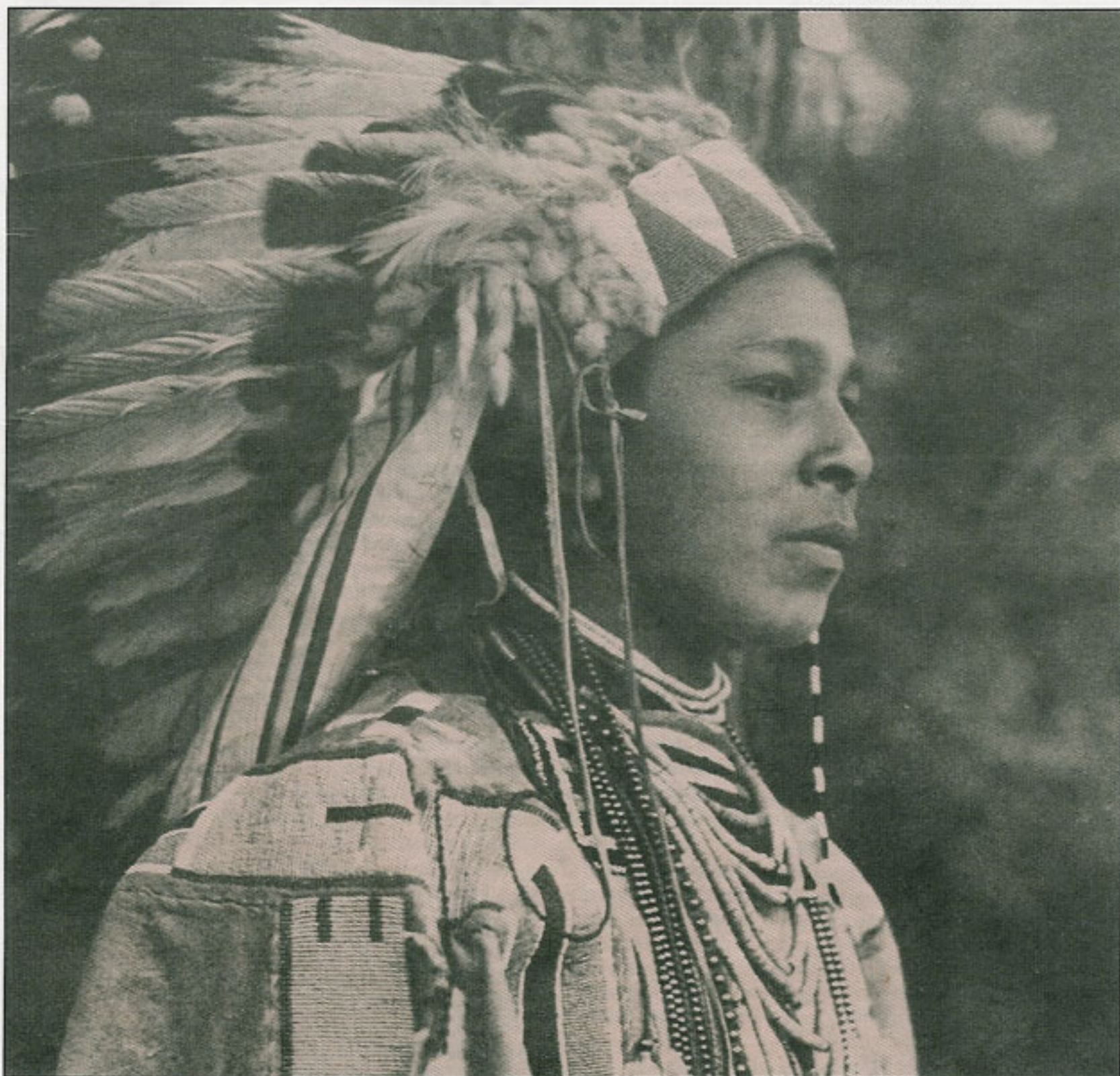
Photograph provided courtesy of Special Collections Division, University of Washington Libraries, Negative No. Na 152