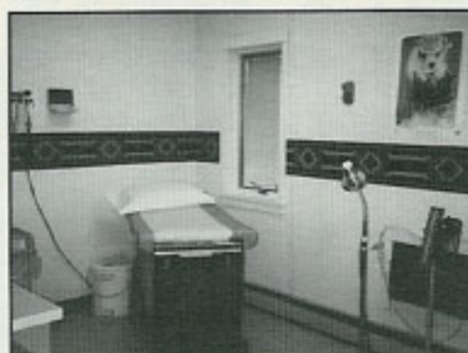
Medical exam room

There are a multitude of questions, concerns, and issues that have arisen regarding Self-Governance that have yet to be adequately addressed by the IHS. Notwithstanding these obstacles, the Nation is excited about the many positive changes that have occurred under Self-Governance in better meeting the health needs of the members of the Penobscot community. ➤