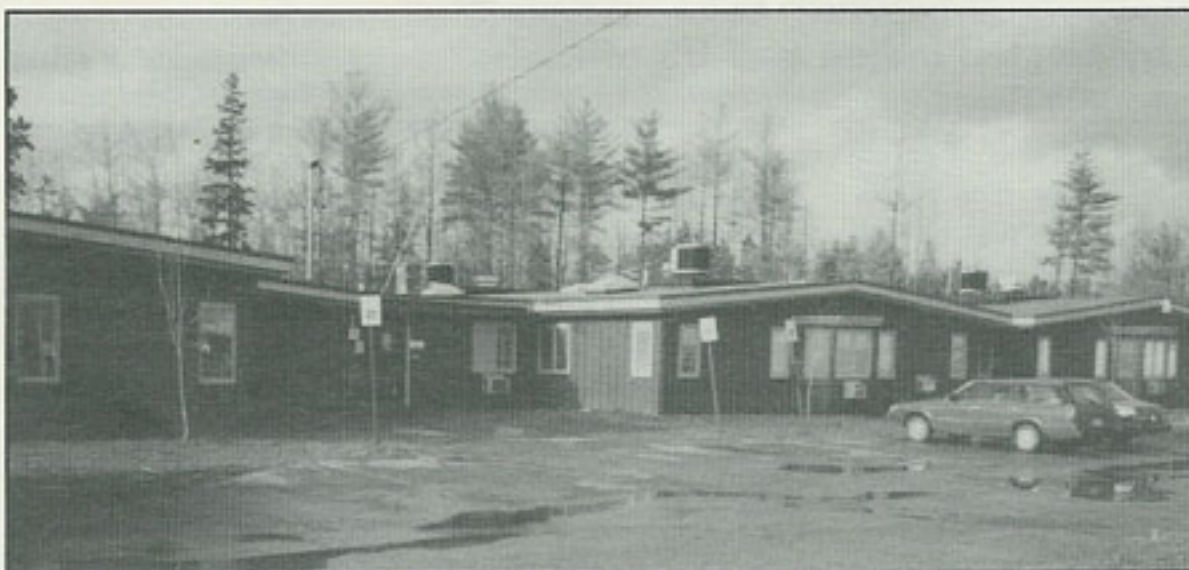
Penobscots Health Center

Decision to embark on Self-Governance... Because the Nation had been successfully managing under a 93-638 contract with IHS since 1978, the decision by the governing body to move into Self-Governance was a logical and wise next step. The rules and regulations that had been imposed by the IHS had often times created an administrative overload for a small, Tribally-operated site such as Penobscot. This administrative burden has competed with the provision of health care. However, Self-Governance has enabled the Health Department to redesign current programs and reshape various scopes of work to address Tribally-specific needs rather than those geared toward larger IHS facilities. The Penobscot Nation admits that the