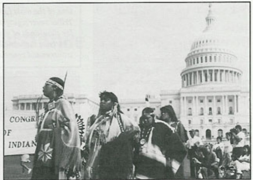
Tribal members dancing on Capitol grounds

3. Self-Governance Council – This council