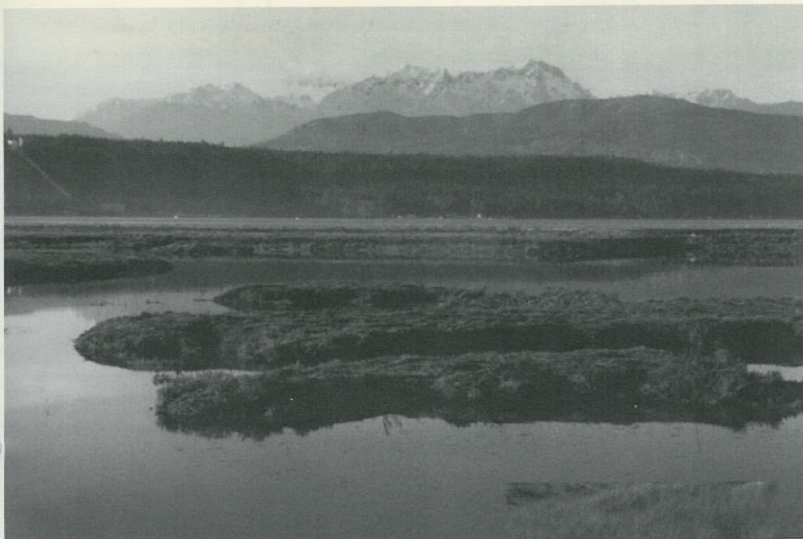
The mouth of the Skokomish River with the Olympic Range in the background, flows into Hood Canal.