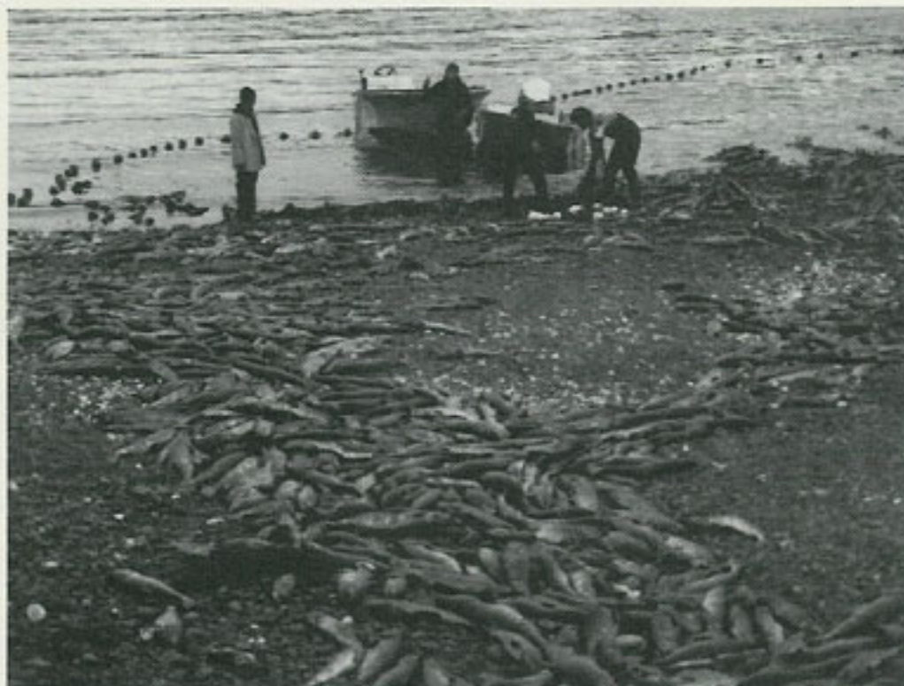
Salmon are an important resource for the tribe.

that during the beginning stages it was very helpful to have good staff people to move the process forward. In addition, he says that cooperation from other Self-Governance Tribes was instrumental in understanding how to begin the process, how to understand concepts like Tribal shares and how to participate in the negotiations. "We couldn't have undertaken this process without the help of these other Tribes."