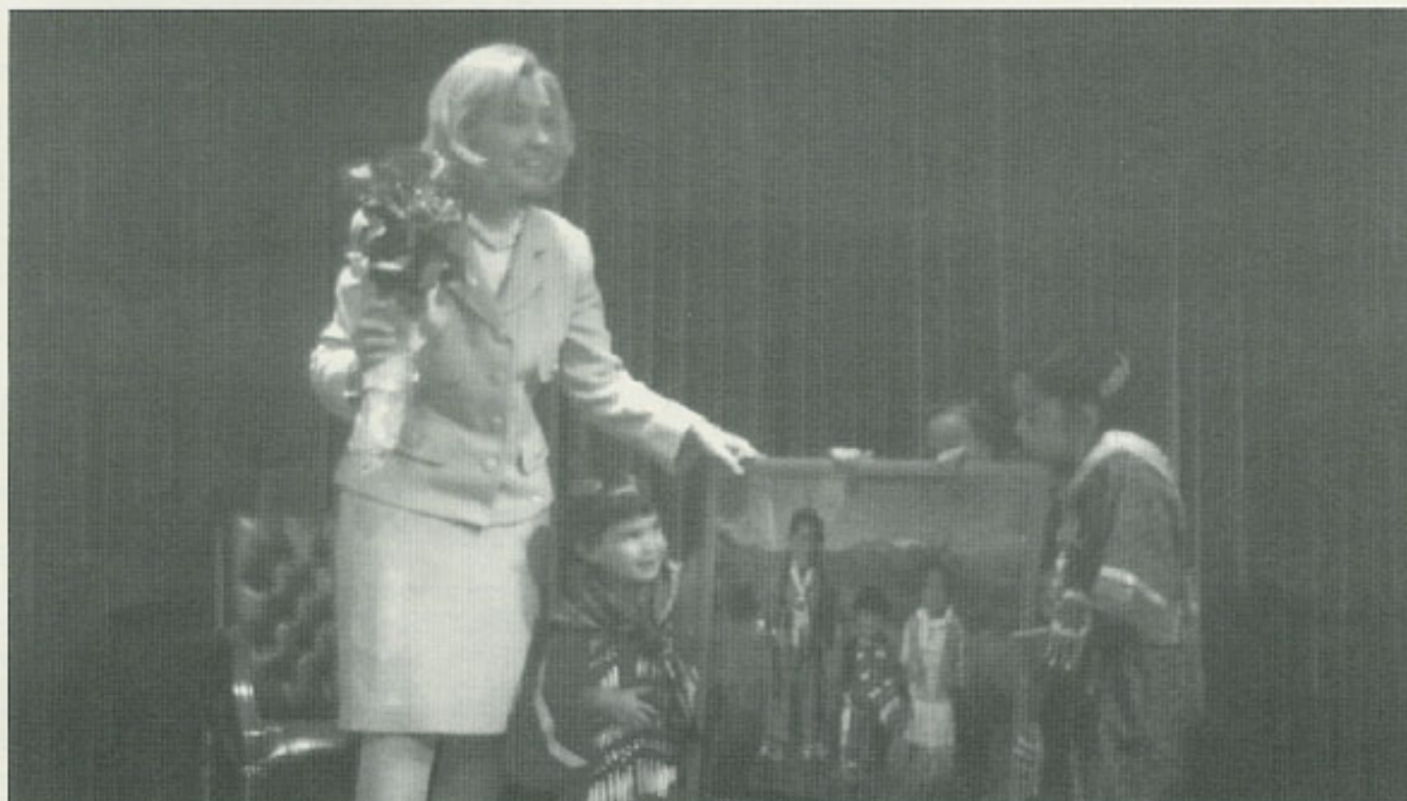
First lady Hillary Clinton at a "Get out the vote" rally with the girls from the campaign poster.