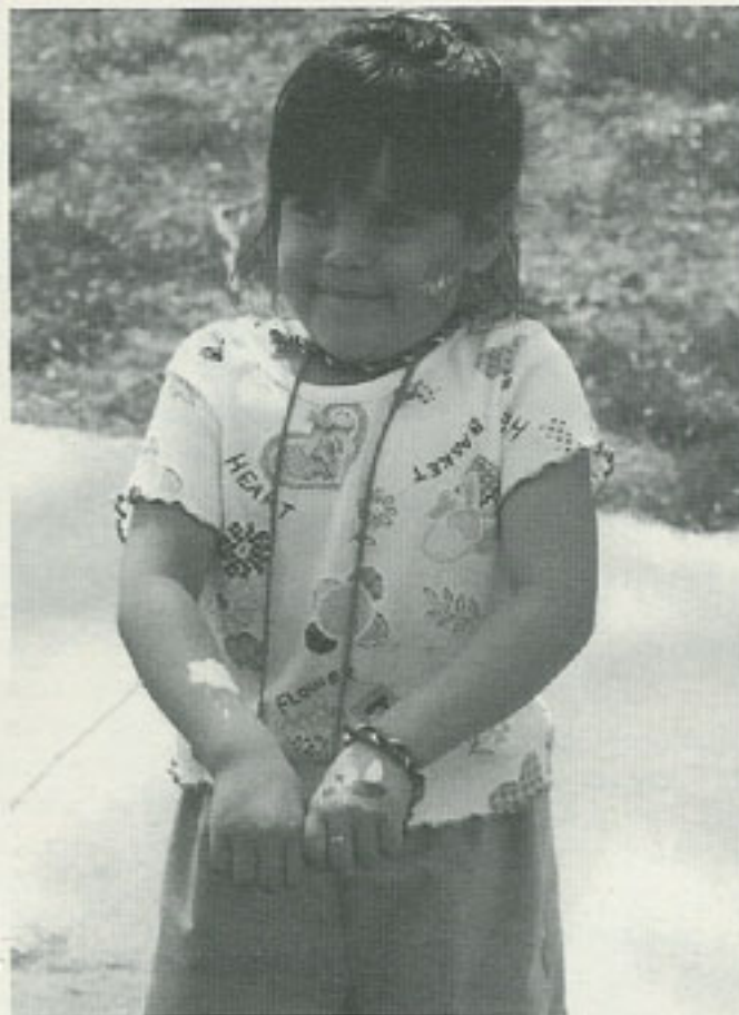
A child's smile is like sunshine in the park. Youth and education is a large part of where the Chickasaw Nation focuses its resources.