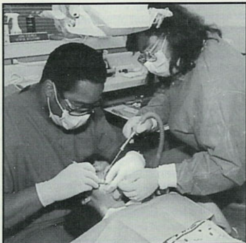
Poarch Creek dental facilities are part of extensive health services.

The Tribal government is comprised of a nine-member Council, with one-third of the members elected each year. The Tribe operates the departments of: Central Administration, Accounting, Employment and Training, Education, Social Services, Health Services, Community Development, Public Safety, Public Works, Tribal Enrollment, Environmental Protection, Economic Development, Tribal