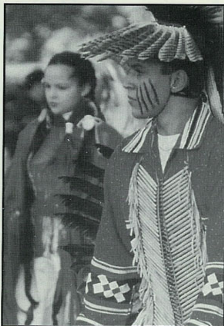
Tribal youth participate in annual Poarch Creek Pow Wow.