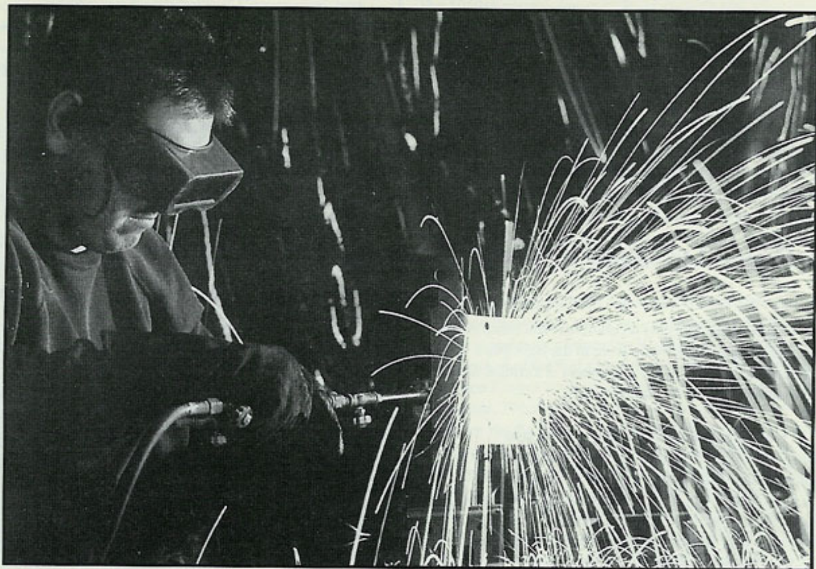
The Muskogee Metal Works is just one of the many Poarch Creek business enterprises.