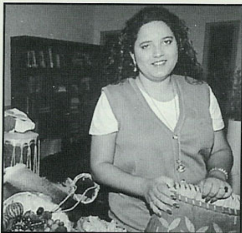
Tribal culture and history are kept alive through demonstrations, dancing, art, and language.