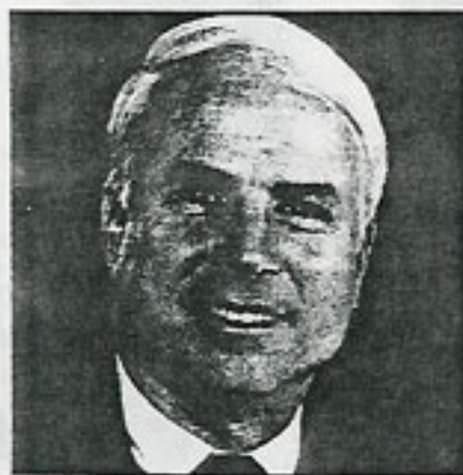
U.S. Senator John McCain

Editor's Note: This feature column will appear in Sovereign Nations from time to time, and be designed to present readers straight answers to some no-nonsense questions about Self-Governance. Featured interviews will be with federal and Tribal officials.