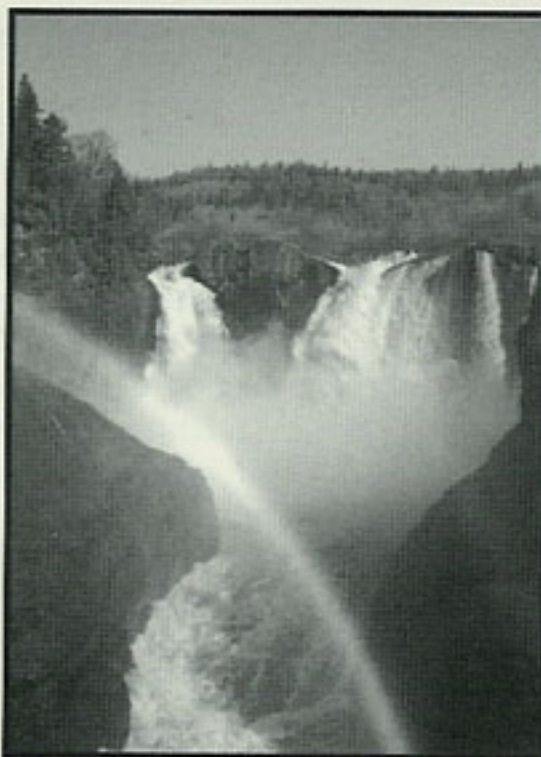
Grand Portage Reservation is home to the highest waterfall in Minnesota. Appropriately named, "High Falls" of the Pigeon River is also the site of Grand Portage State Park, the only state park in the nation located on tribal trust land.

Earth reservation, withdrew. In 1934, Congress passed the Indian Reorganization Act (IRA), affording tribes the right to elect leaders and govern themselves provided that the tribe adopted a constitution. Many of