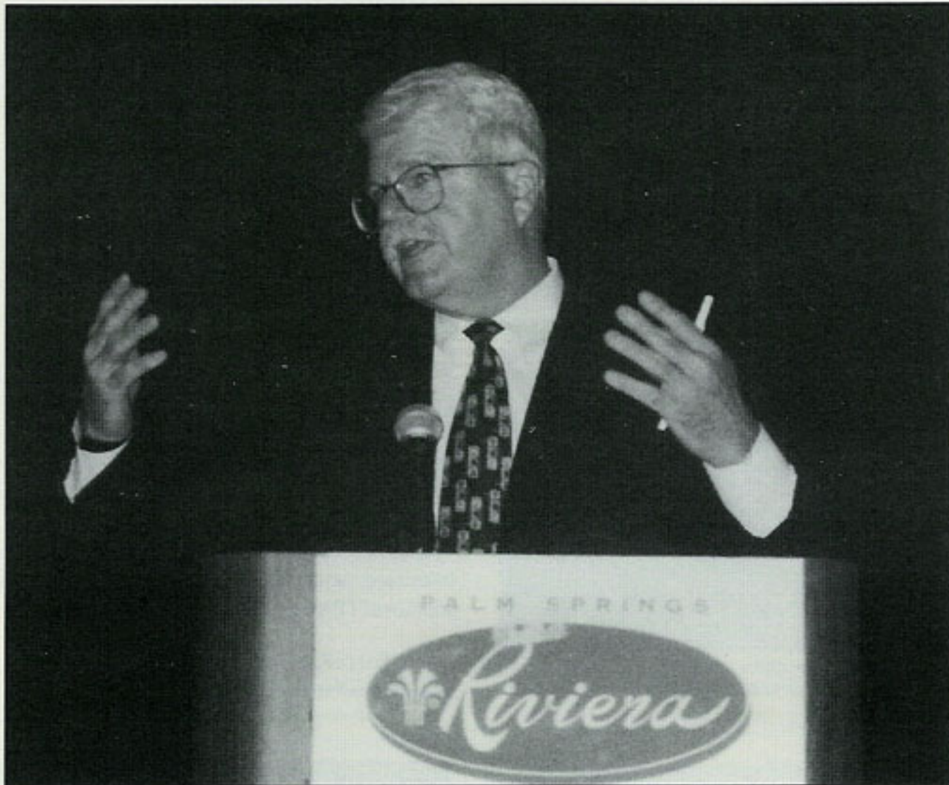
Congressman George Miller announces plans to reintroduce Title V Self-Governance legislation.