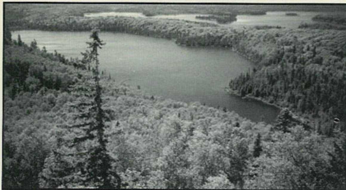
The lakes and forests of the Grand Portage Reservation are typical of the Minnesota border country. Forests of pine, birch and aspen blanket the 90 square mile Reservation.

and the other was Grand Portage. The Treaty was signed by Shaganahshins, Ahdikonce, and two clan chiefs.