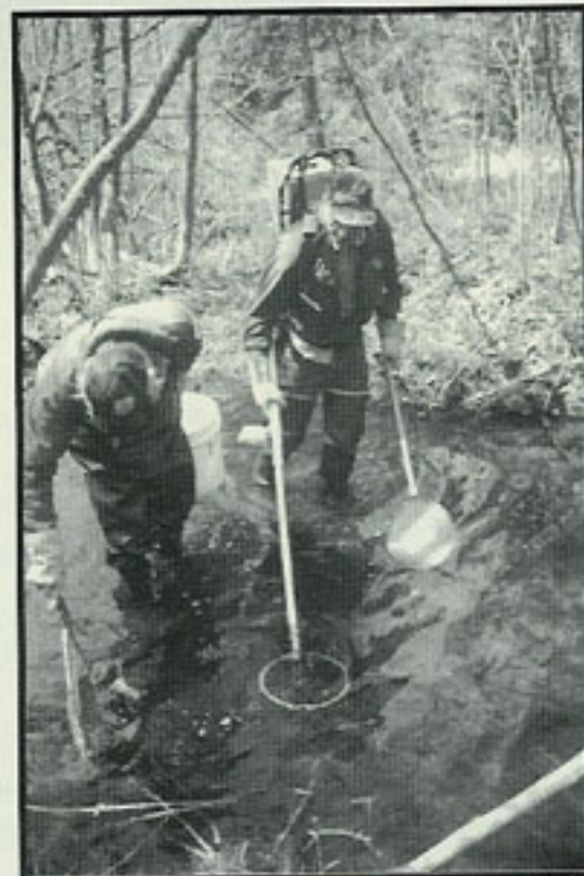
The Natural Resources Program at Grand Portage has blossomed under Self-Governance. Previously staffed only to cut and sell timber, the program now boasts a GIS, Recreation, Realty and Biology department. Here, Grand Portage biologists check a stream for coaster brook trout. One of only two native trout to Lake Superior, the "coasters", nearly extirpated from the area for the past 70 years, have been successfully re-introduced by the Grand Portage program.

The Grand Portage Reservation was created by the Treaty of 1854 in La Pointe, Wisconsin. There, Lake Superior, Mississippi, and the Bois Forte Chippewa Bands ceded iron-rich land at the western tip of Lake Superior, north to the U.S. Canadian border. Two small reservations were created by Treaty of 1854. One was Fond du Lac,