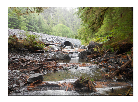
Hydaburg Fish Passage, Alaska