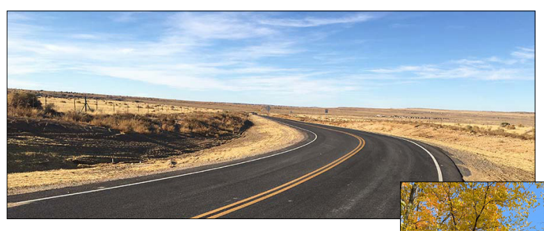
Navajo Nation - Littlewater, New Mexico

The TTP is jointly managed and administered under a memorandum of agreement between FHWA and BIA that was established in 1983, and amended in 1992. [25 CFR 170, Background, November 7, 2016]