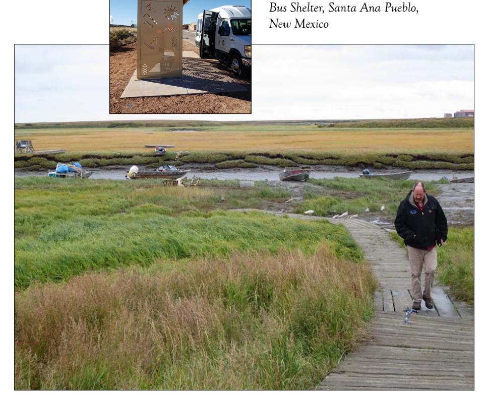
Kongiganak Village Boardroads, Alaska

There are other discretionary grants such as the BUILD Discretionary Grants, Accelerated Innovation Deployment (AID) Demonstration, and many others.